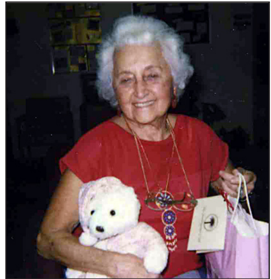
Elderhelp recipient with Valentine's Bag from the Burlingame Club

This year, for the 4th year, members will celebrate the holiday by preparing 50 gift bags for Elderhelp clients. Members have been generous in donating soaps, lotions and other toiletries. One brand new Burlingame Club member has volunteered to purchase tea towels to go into each bag. Another member has been collecting and making goodies all year long. The packed-to-the-top bags will be taken to Elderhelp in time for Valentine delivery. They are looking forward to passing them out again this year.