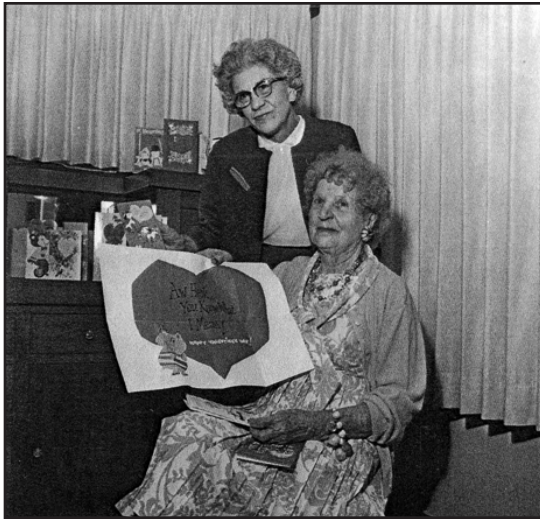
Burlingame Club members at a Valentine party in the 1950's.

So begins a page we found in the Archives at the San Diego Historical Society. The Burlingame Club collection, there, is filled with minutes, treasurer's reports, pictures and member recollections. The purposes of the Club from its inception in 1913 are the same ones we follow today: "to promote social fellowship among the residents of Burlingame and stimulate the spirit of civic improvement".